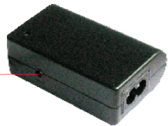
car charging hole (fixed with a car charging plug)